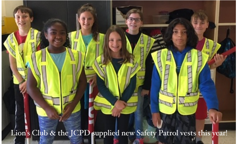
Lion's Club & the JCPD supplied new Safety Patrol vests this year!